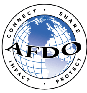
Grand Rapids, MI June 9-12, 2024